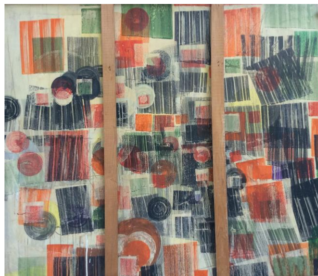
Back side of the painting on offer

the picture plane bear witness to the influence of Lucio Fontana's Concetto Spaziale . On the back of the work is a second painting that is very characteristic of the artist's style of the mid-Fifties.